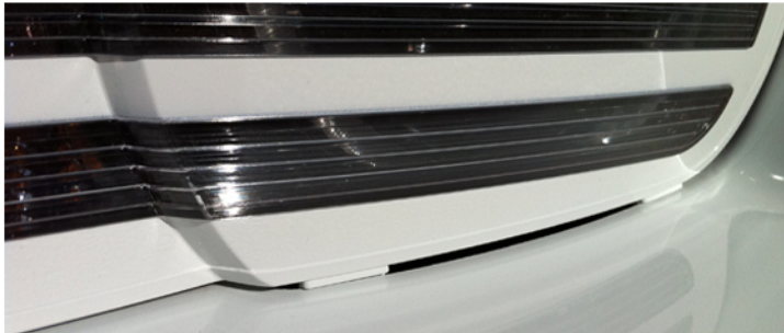
4) PROPERLY FIT BOTTOM TABS.