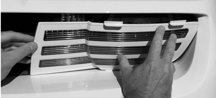
1) FIT BOTTOM TABS BETWEEN THE HEADLIGHT LENS, AND THE FACIA.

IMPORTANT: PRO CUSTOM PRODUCTS, INC. IS NOT RESPONSIBLE FOR IMPROPER INSTALLATION. IF YOU DO NOT FEEL 100% CONFIDENT INSTALLING THIS PRODUCT, SEEK PROFESSIONAL ASSISTANCE.