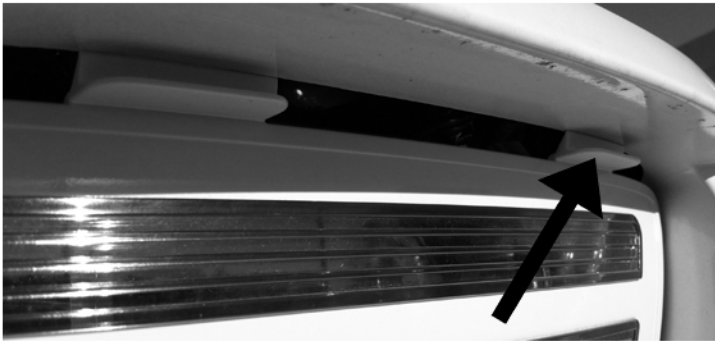
3a) FIT THE TOP TABS BEHIND THE FACIA. SHOWN HERE: IMPROPERLY FIT