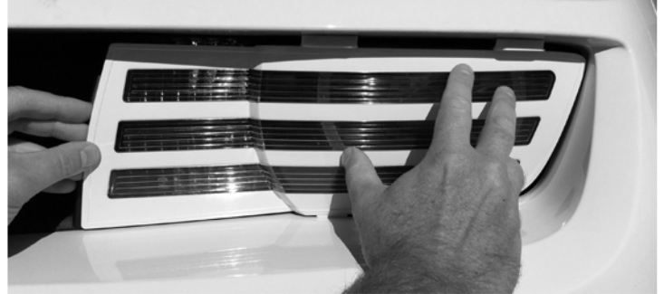
2) TIP THE TOP OF THE HEADLIGHT COVER BACK.