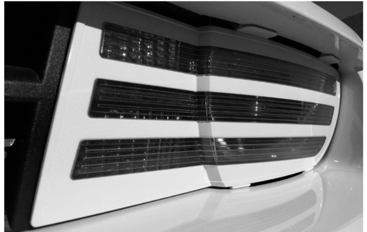
5) PROPERLY INSTALLED HIDEAWAY HEADLIGHT COVER. ENJOY!